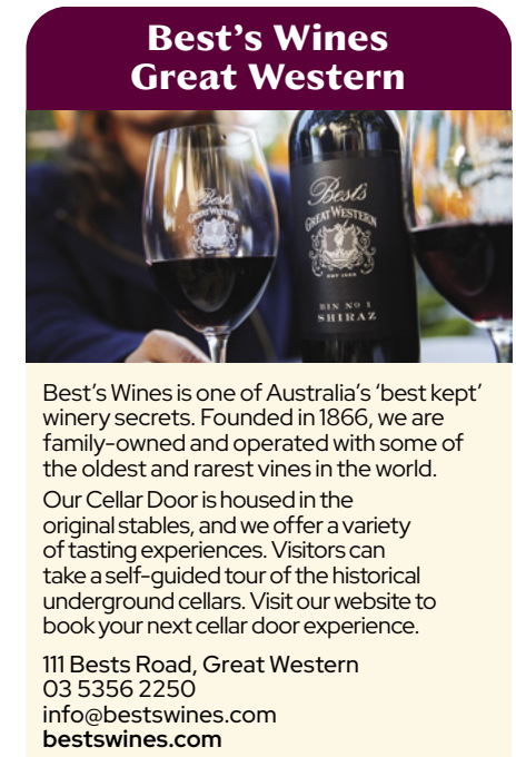
Examples of 1/4 Page Advertisements